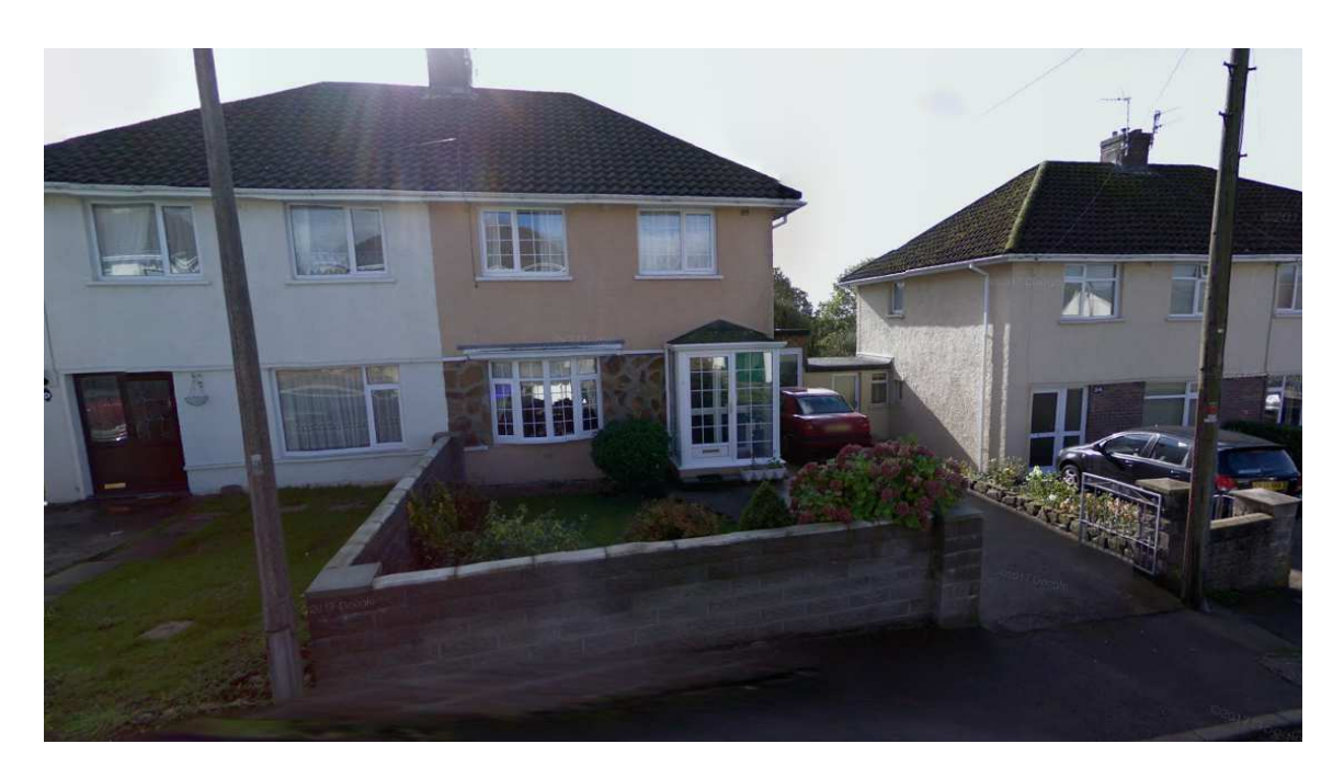
Streetscene View of 26 Heol y Mynydd

The site itself comprises a semi-detached, two storey property which faces north. The dwelling is positioned forward of the centre of the residential plot of around 300 square metres, adjacent to the eastern boundary of the application site and 28 Heol Cambrensis. The land slopes gently from east to west.