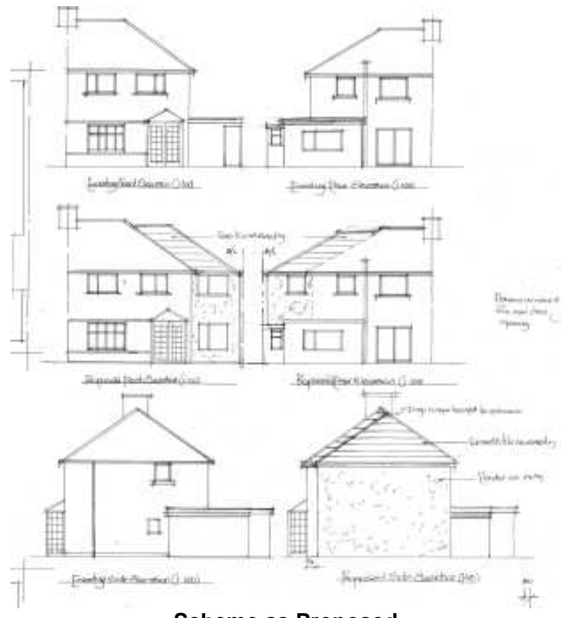
Scheme as Proposed

The extension is proposed to be finished in materials that match the host dwelling and will retain its character and appearance, in accordance with Note 11 of Supplementary Planning Guidance Note 02.